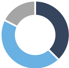
GWP BY US DISTRIBUTION

■ Retail (38%) ■ Wholesale (44%) ■ Reinsurance (18%)