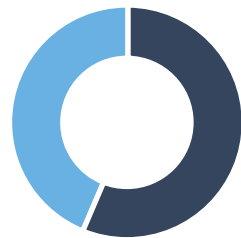
GWP BY DISTRIBUTION (EXCLUDES REINSURANCE)

approach supported by robust centralized platform including actuarial, administrative, legal, compliance, IT and accounting services. Ryan Specialty's resources and support deliver an exceptional level of service to brokers, agents, and carriers.